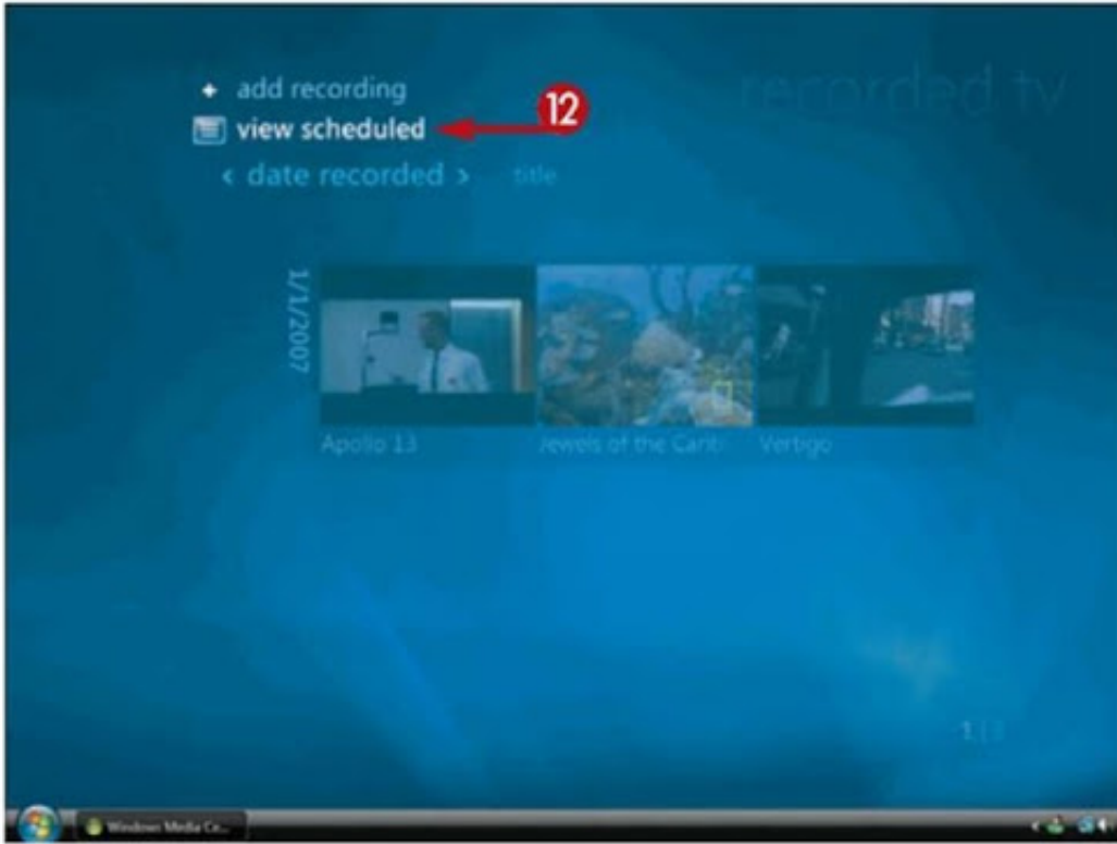
Windows Media Center:Always Recording